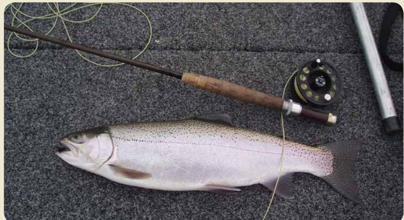
Brown and Rainbow trout Redfin perch and tench