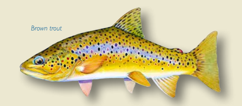
Brown trout illustration Trevor Hawkins