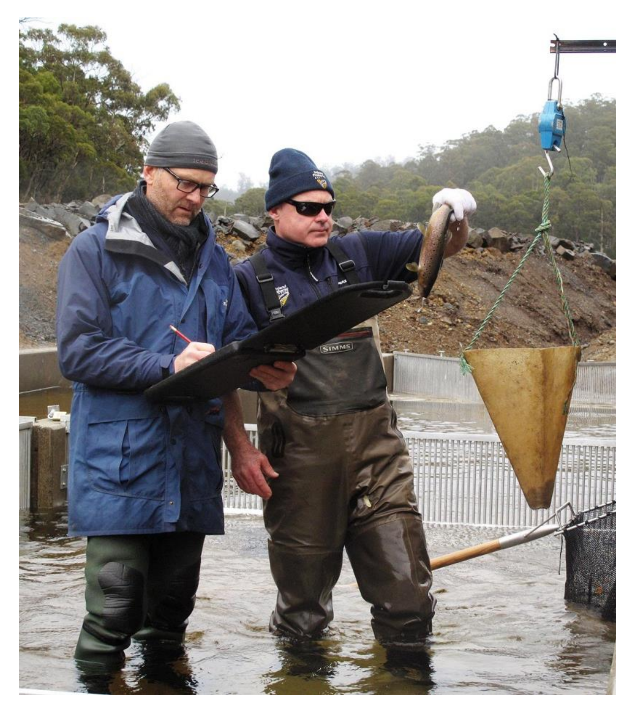
Monitoring the brown trout spawning run at the River Derwent Fish Trap, Lake King William