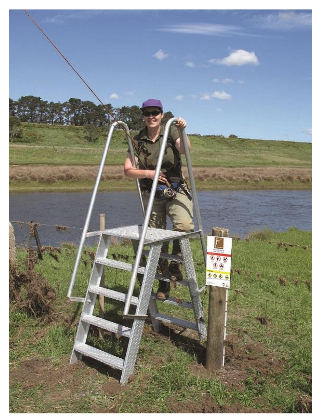
Angler access to the Macquarie River