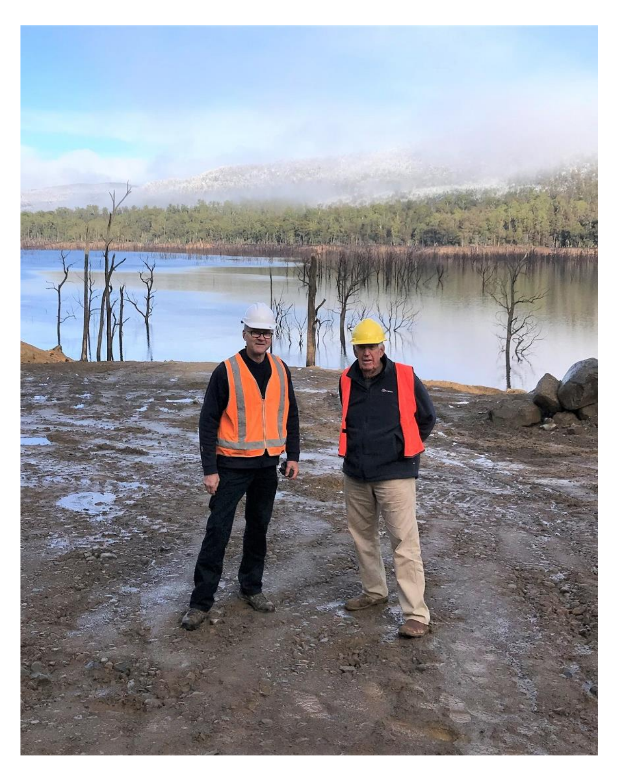
Anglers Alliance, Hydro Tasmania, MAST and the IFS working to improve Lake Rowallan boat ramp