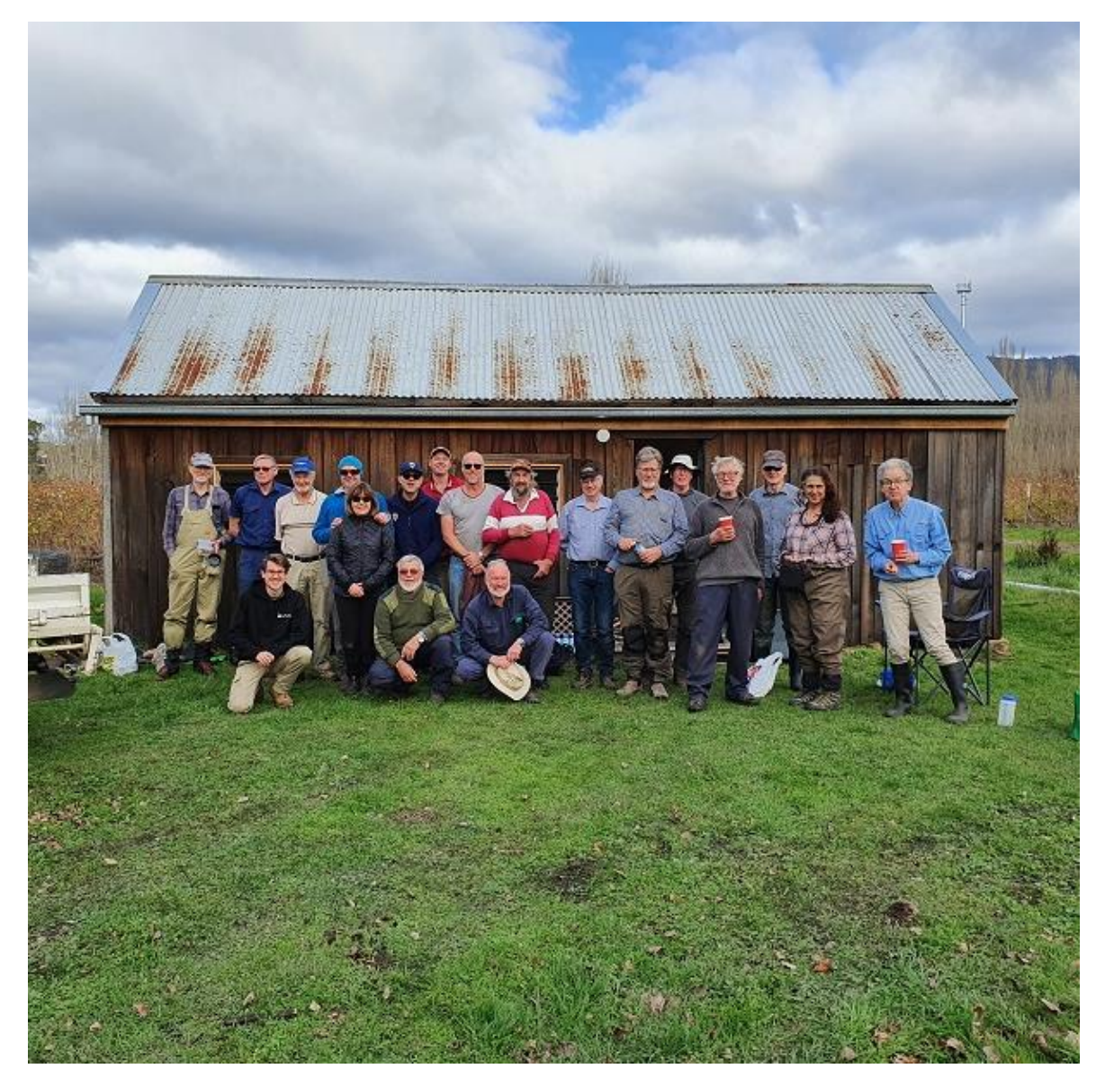
Willow Warrior's, Tyenna River (Derwent Catchment Project)