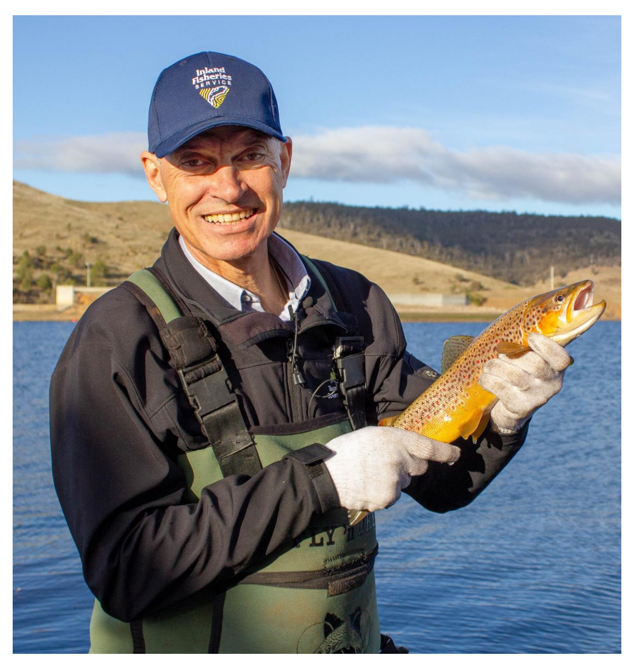
The Hon Guy Barnett, MP, Minister for Primary Industries and Water, with a brown trout at Craigbourne Dam