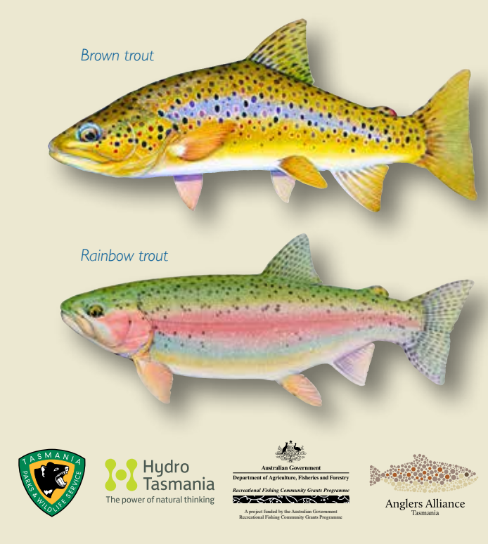
Brown and Rainbow trout Pedder galaxias