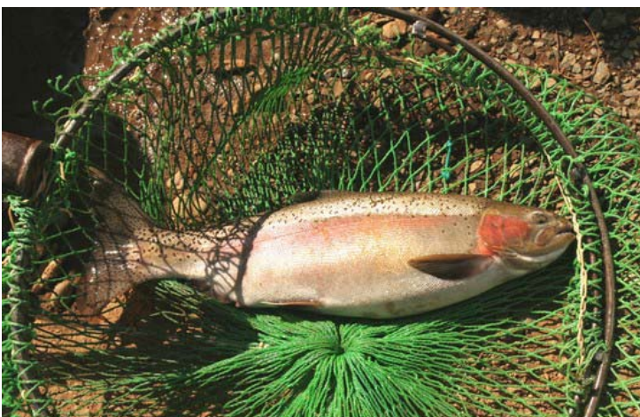
A female rainbow trout from this years' spawning run at Liawenee.

Redfin perch predate heavily on fry that are migrating from nursery streams into lakes and lagoons. The aim of growing out these fish at IFS hatcheries is to get them to fingerling size where they will have an increased survival rate.