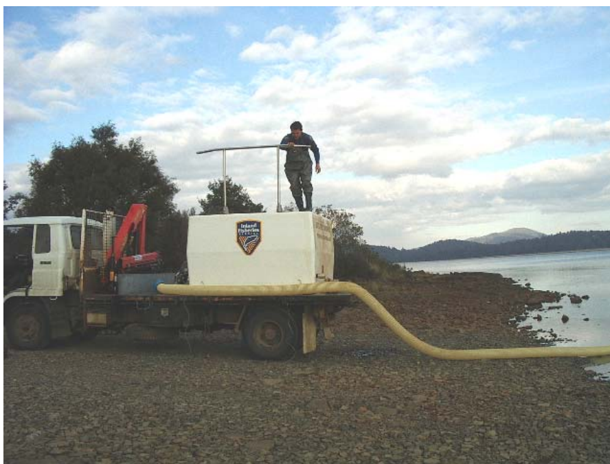
Unloading 1200 brook trout into Bronte Lagoon during the last week of April this year

Sevrup Fisheries have supplied, as part of an agreement with the IFS, 10 000 yearling brook trout. These fish average 300 grams and are of catchable size now. These fish have been stocked primarily in the Bronte—Bradys system as well as Craighourne Dam and Brushy Lagoon. This supply follows on from similar numbers last year and means that brook trout should become a significant element of these fisheries.