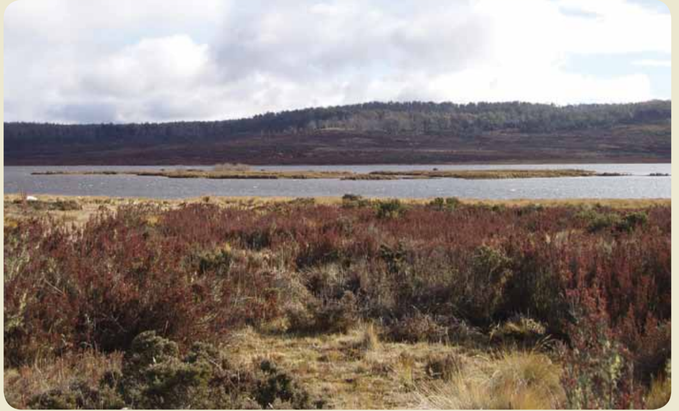
Brown trout illustration Kristii Melaine