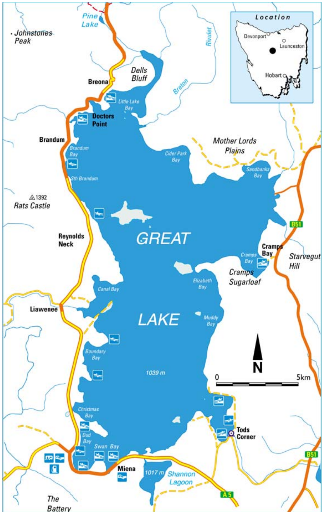
Figure 1. Map of Great Lake.