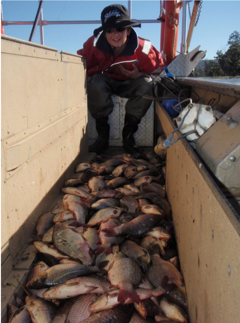
Figure 1. A big haul of juvenile carp caught on the electro-boat