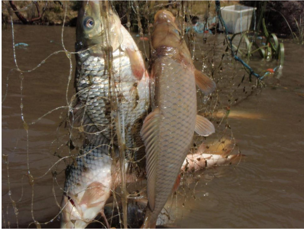
Figure 2. Juvenile carp in shallow water caught in gillnets