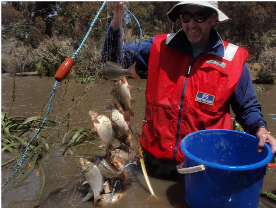
Figure 3. A successful shallow water targeting event