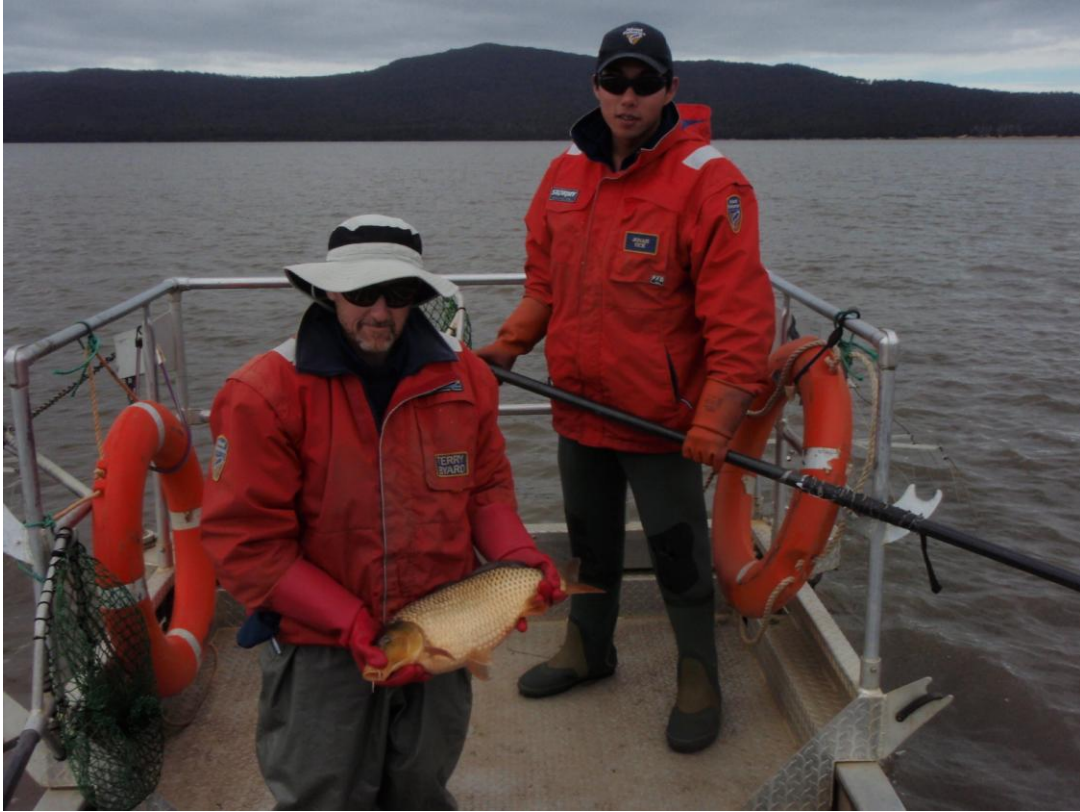
Figure 4. A mature female carp caught on the electro-boat