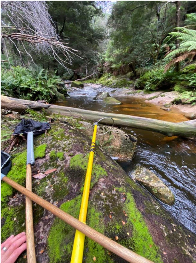
Cascade River, 100m upstream from where the 'Atlas' mountain biking track crosses the river.