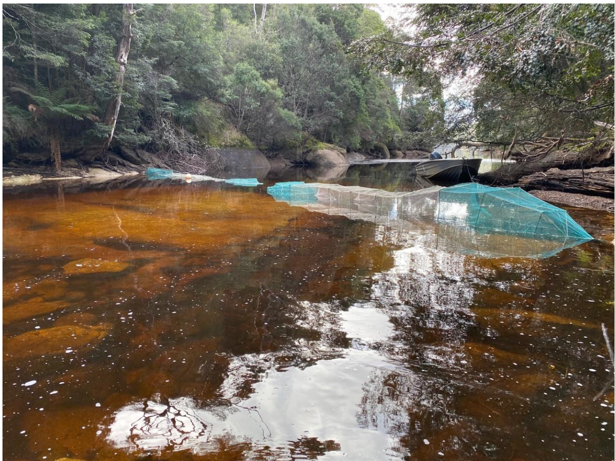
Box traps across the mouth of the Cascade River where it enters the Cascade Dam. This was particularly successful on 12 May with larger fish moving into the river to spawn