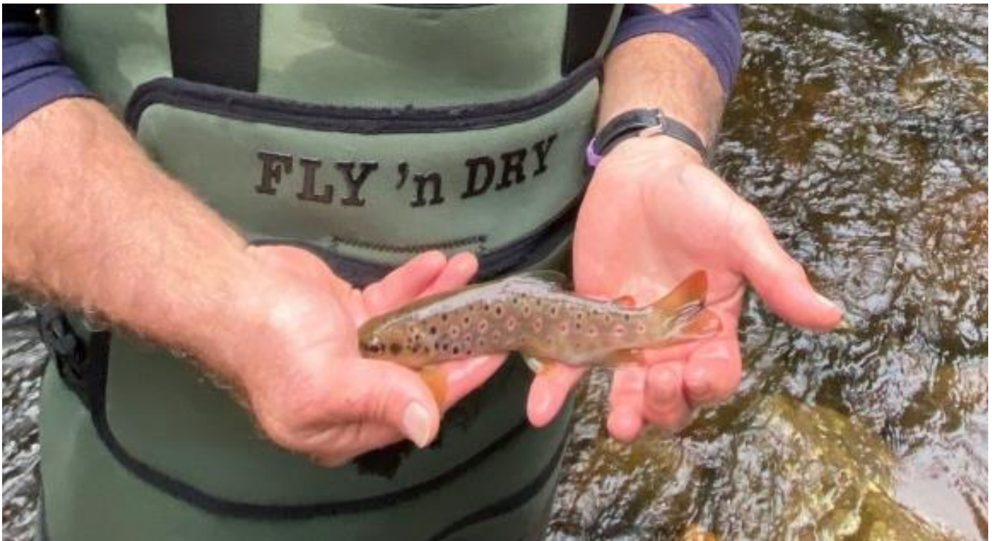
Cascade River brown trout electrofished from the middle reaches.