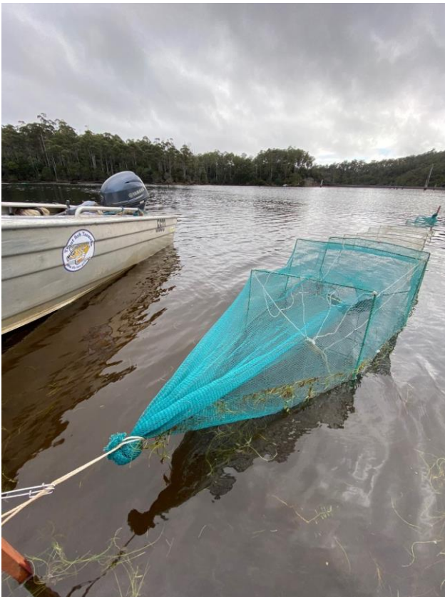
Box traps set in Cascade Dam