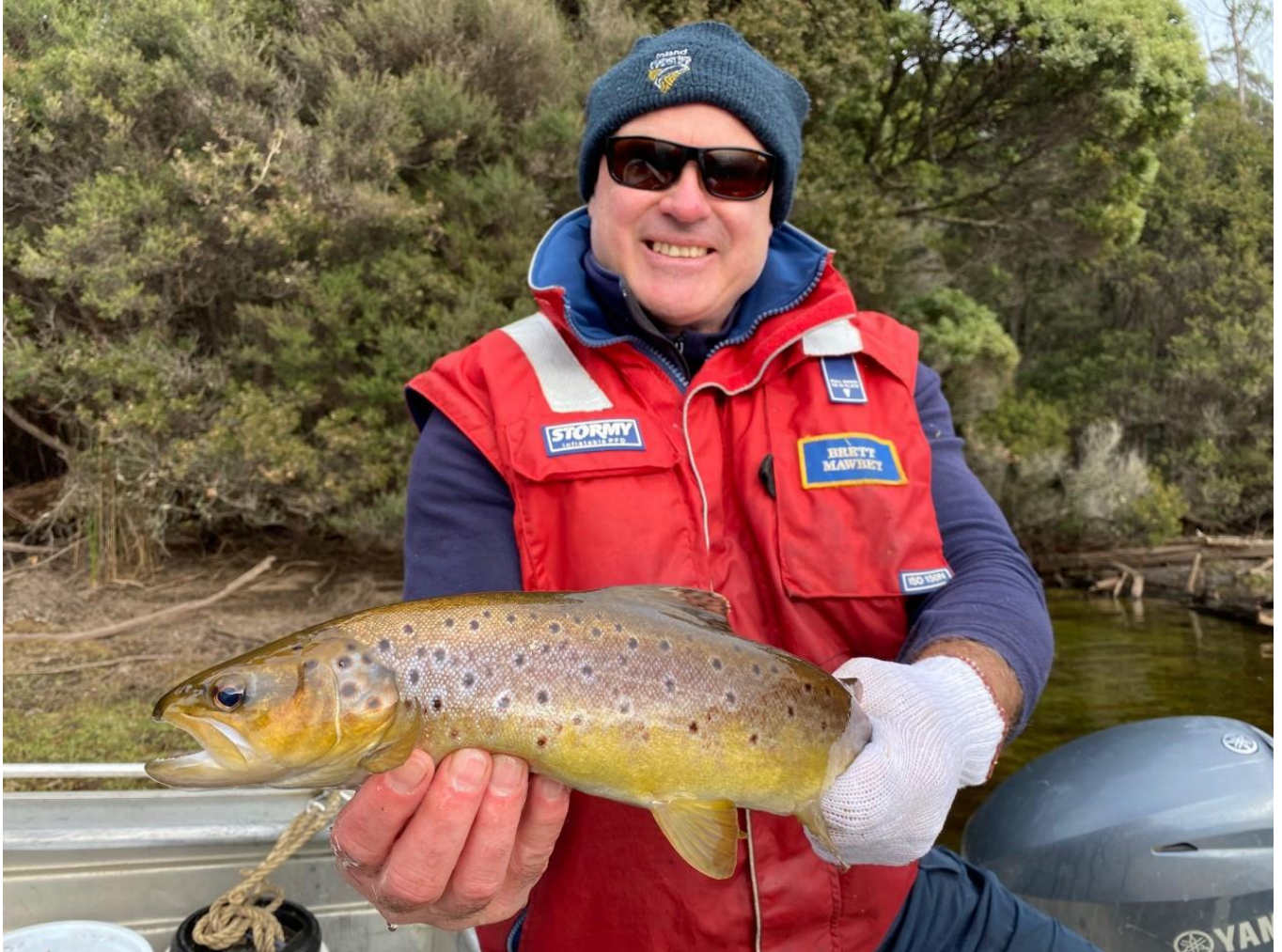
Cascade Dam brown trout measuring 416mm.