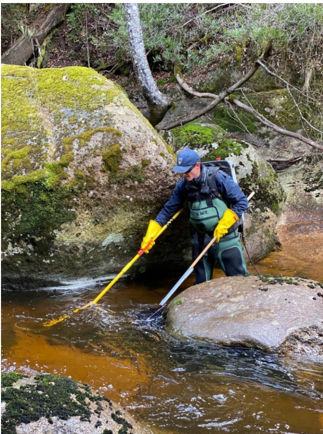
Electrofishing the middle reaches of the Cascade River