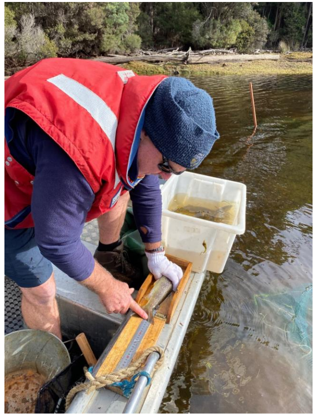
Measuring a typical Cascade Dam brown trout