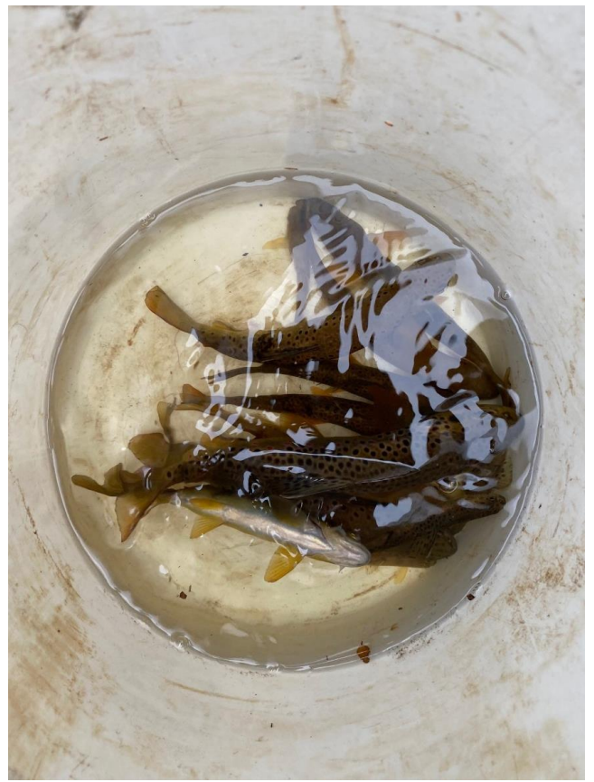
A typical haul of Cascade River brown trout, caught while electrofishing