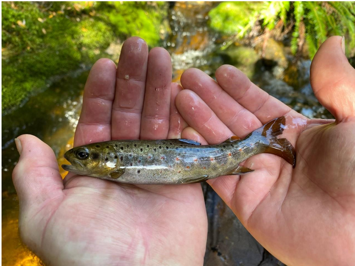
Cascade River brown trout electrofished from just above Cascade Dam