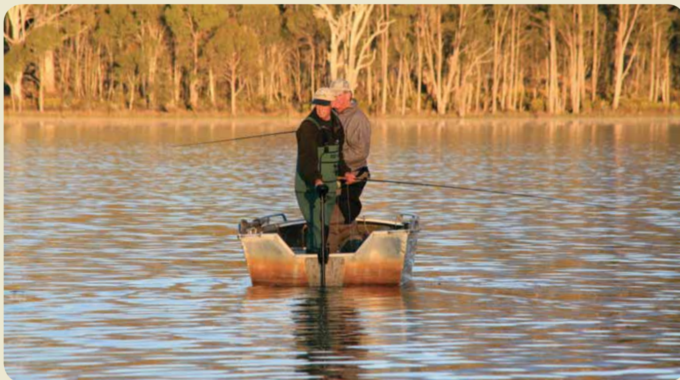
Brown and Rainbow trout